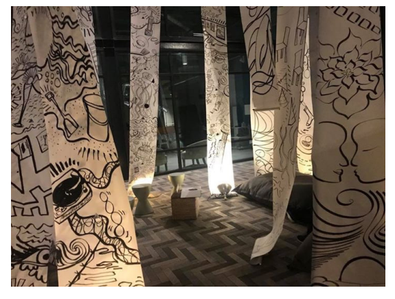
"Thought Forest" by Crystal Daigle at Sensorium, 2018