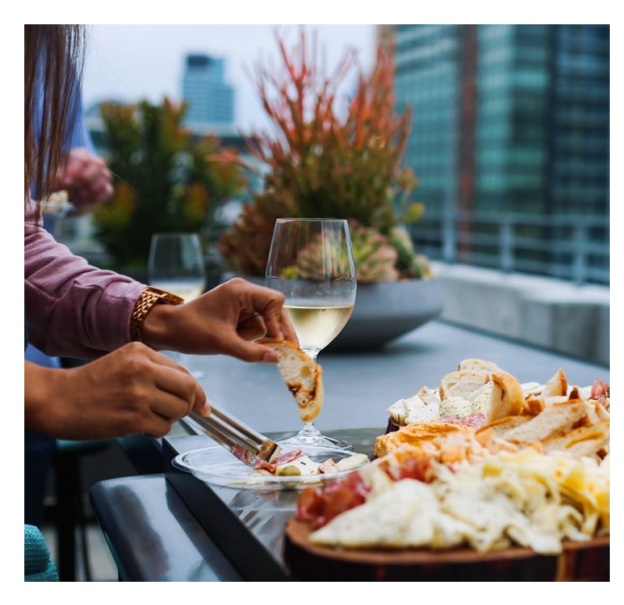
Meet-The-Winemaker Series, 2019

Since 2015, Vanguard Culture has hosted 14 Artist @ The Table dinners featuring the region's most notable creative industry leaders.