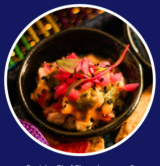
Ceviche Chef Showdown, 2018