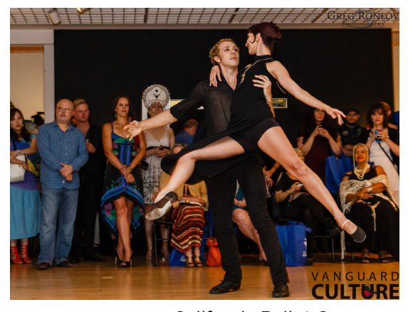
California Ballet Company Avant-Garde Costume Gala, 2018