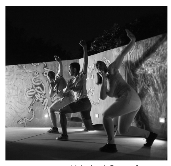
Malashock Dance Company at Foodie Soiréee 2015

By the end of 2019, Vanguard Culture will have hosted over 30 free or low-cost professional development workshops.